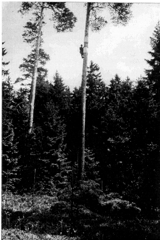
Figure 2. Natural nest hole protected by cuffs of sheet-iron.