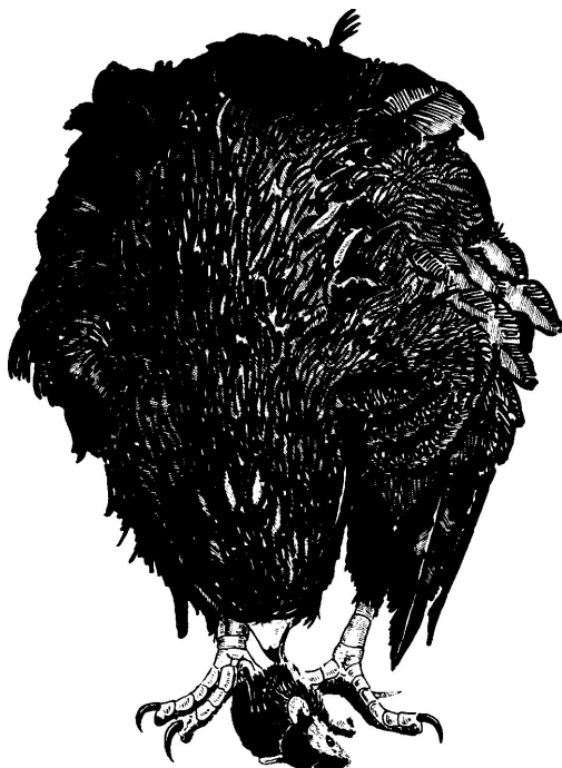
Figure 3: The typical ingestion posture. The use of two legs for blocking the mouse on the ground is shown. (Drawn from a photograph).

Prey ingestion was carried out with the birds constantly displaying a particular "ingestion" posture (Fig. 3), different from the "blocking" posture described above, and generally at the place of capture. Independently from the time taken for ingestion the Buzzards never lost contact with the mouse. The raptor stood over its prey, holding it with its head facing towards the Buzzard itself and both feet "blocking" the mouse at the centre of its body. The eventual ingestion started from the mouse's head. The feet held the prey on the ground while the bill tore off scraps of flesh. The hind part was ingested whole, and no individual left any part of the mouse uneaten.