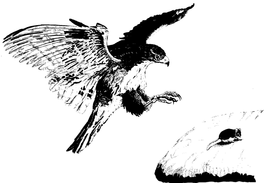
Figure 2: The direct approach to the mouse. (Drawn from a photograph).

The capture was carried out with a mean latency of 1072.8 \pm 187.4 seconds. Juvenile birds had a slightly higher latency: 1147.4 seconds against 640.4 seconds. Furthermore, even though the mouse moved freely over the platform, capture occurred invariably when it was facing away from the Buzzard, as has already been reported for other species of the same family (Brosset 1973).